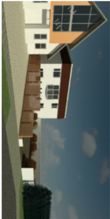
2 1:1 3D View 2_1