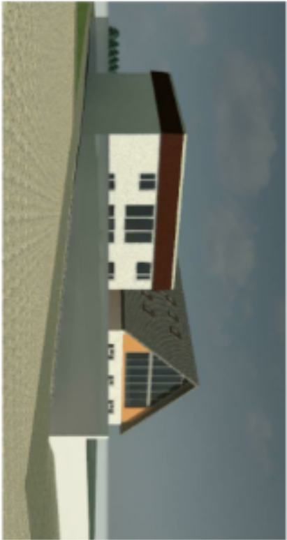
3 1:1 3D View 3_1