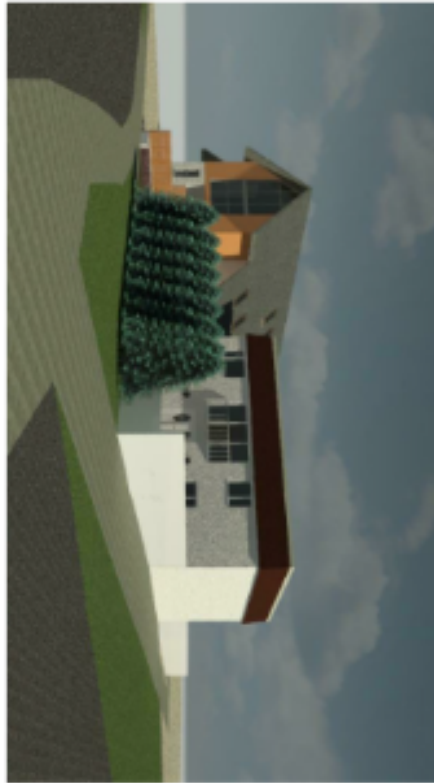
1 1:1 3D View 1_1